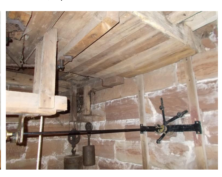
June 2017 automatic winding installed: extra framework clamped (not bolted) to existing frame, new weights & pulleys, battery backup attached to cupboard